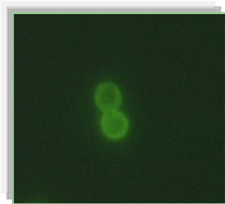
Cryptosporidium stained with immunofluorescent antibody (IFA) at 1000X magnification

Interpretation of Cryptosporidium and Giardia positive results is difficult since the protozoans detected may be dead, the Cryptosporidium or Giardia detected may not be infective to humans, or the monitoring recoveries of the parasites are low. Only intact cysts or oocysts have the potential to be infective, however, the presence of even an empty Cryptosporidium or Giardia indicates infiltration into the water supply.