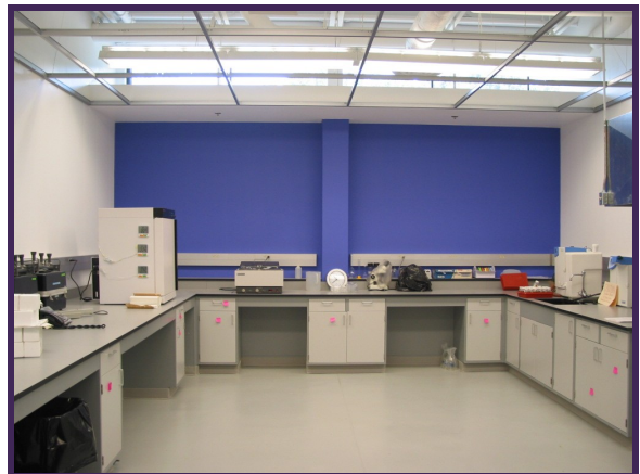
MMLI Corporate Laboratory, Madisonville, KY Microbiology Laboratory

For more information, log on to our website at www.mccoyslabs.com