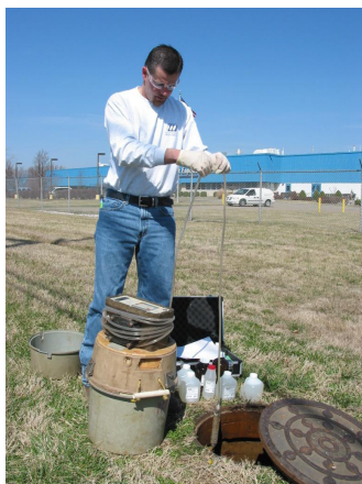
Field Technician collecting an industrial discharge from a manhole.

To successfully meet the challenge of obtaining a sample representative of the source, it is important to know how and when to collect samples. Depending on the analysis to be completed, the sampling procedure may be a simple grab sample taken from a single monitoring point or collection of multiple sub-samples from one or more points over a specified period of time. If sampling is being done for regulatory compliance, the monitoring method and frequency are dictated by permit specifications.